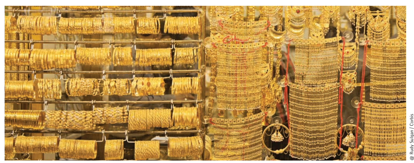
Jewellery at the Gold Souk in Dubai.